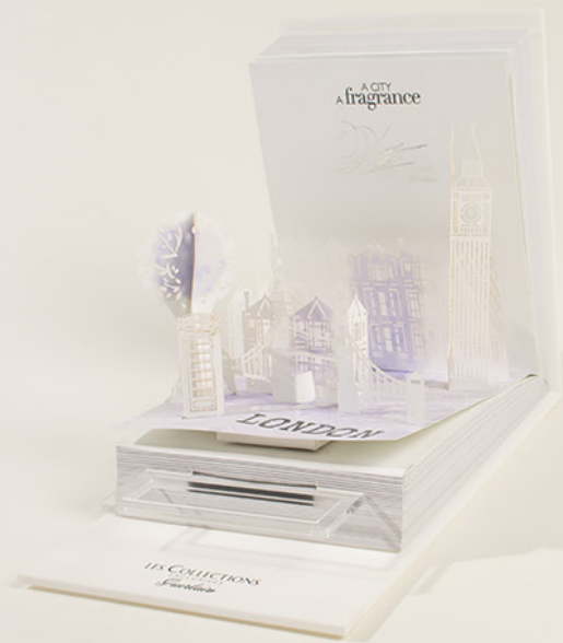
TEMPORARY POS DISPLAY