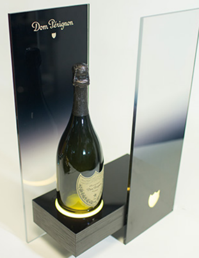
PERMANENT POS DISPLAY