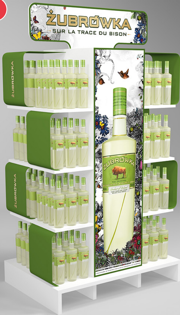
PERMANENT POS DISPLAY