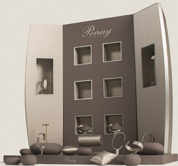
PERMANENT POS DISPLAY