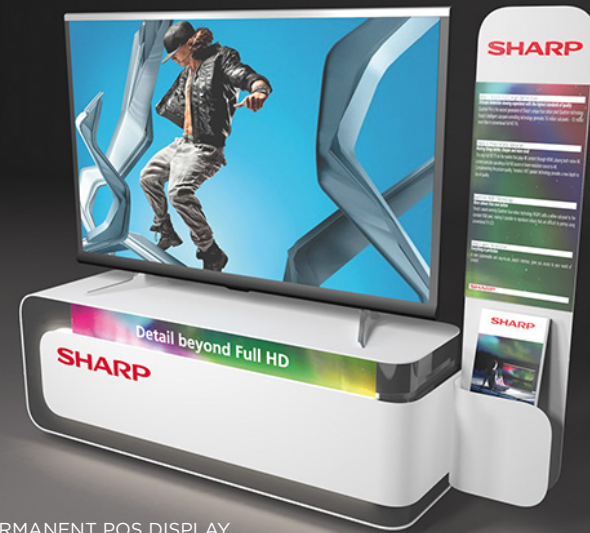
PERMANENT POS DISPLAY