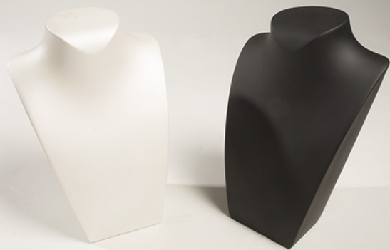
PERMANENT POS DISPLAY