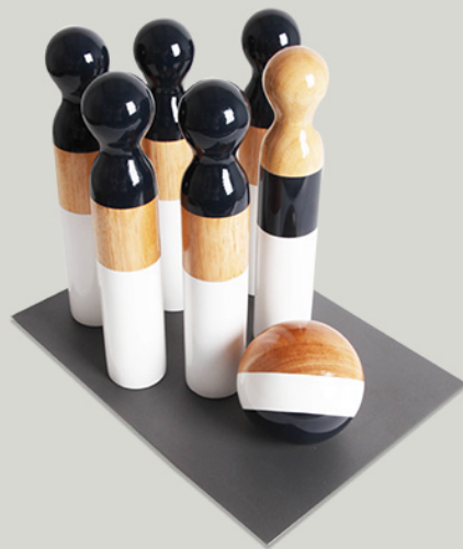
PERMANENT POS DISPLAY