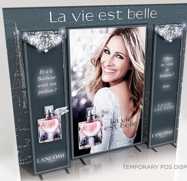
TEMPORARY POS DISPLAY