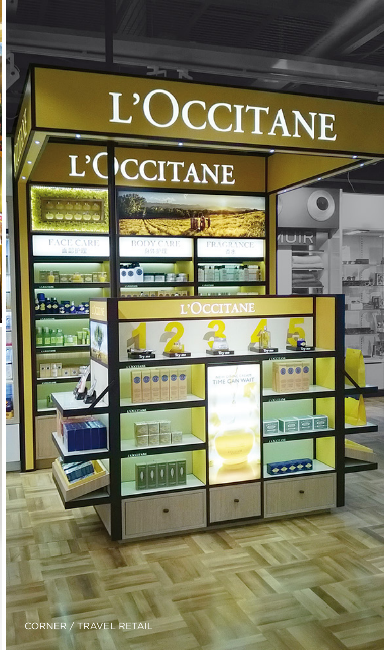
CORNER / TRAVEL RETAIL